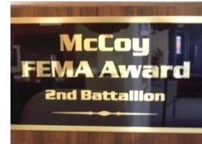
The McCoy FEMA Award

for his dedication to going well above and beyond what was required. He inspired an unofficial competition amongst 2BN troops to either beat or match his feat. Soldiers who complete 25 FEMA Courses have his/her name inscribed on a plaque which hangs in the 2BN Office at the Marietta Armory. So far, 3 others have accepted the challenge with a few more getting close. Are you up to it?